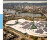
Oregon Convention Center